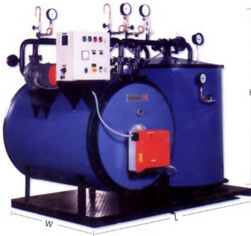
Aquamatic unit with calorifier