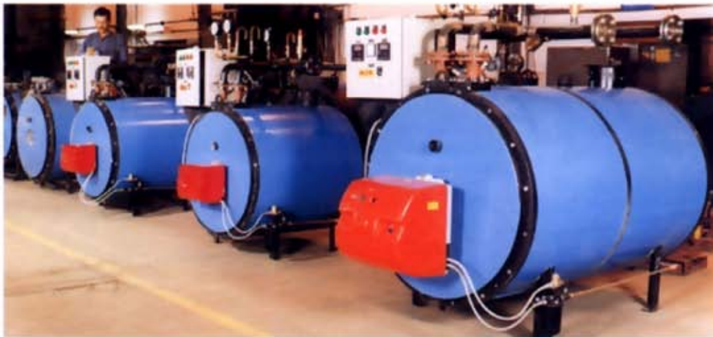
A view of the assembly shop

Aquamatic comes to you with the Thermax stamps of quality assured manufacturing and leadership in thermal engineering. All this is backed by the all India Service network of Thermax which provides prompt and timely service whenever you need it.